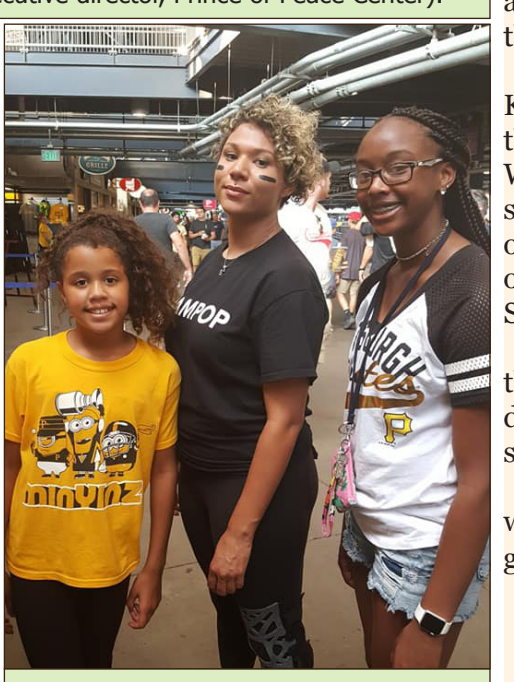
Pittsburgh Pirates Game Community Outing

Prince of Peace Center Summer Block Party at Veterans Square